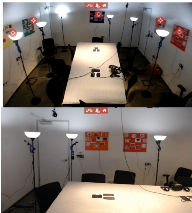
Figure 2. We demonstrated ICC using a meeting room outfitted with 11 webcams (top). Different perspectives of the room (bottom) could be viewed by selecting hotspots (the red circles in the top image) in the web app.

Infrastructure Camera Control (ICC) allows a smartphone user to access, control, and capture images from cameras located at a specific location, such as an amusement park, public square, or the user's home. ICC was inspired by survey respondents who mentioned difficulties controlling their phone and navigating inaccessible environments; our probe aims to give people with motor impairments opportunities to capture photos from perspectives or vantage points that may not have been accessible to them. Once a user has gained access to the network of cameras, the user can alternate between different cameras to find the desired view. The user can also tilt and pan the camera, as well as zoom in and out. When the user captures a photograph, it will be stored directly on the user's phone.